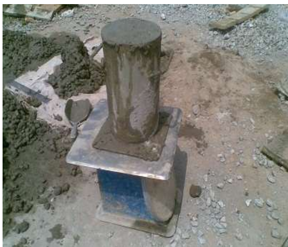
Figure 3. Concrete filled cylinder on weighing balance