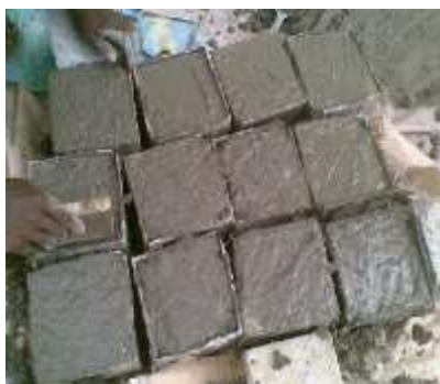
Figure 1. Molding of Concrete Cubes

A total of 120 cubes were cast comprising of control cubes and cubes containing 1%, 2%, 5%, 10% and 15% orange leaf powder by weight of cement. A mix ratio of 1:2:4 (that is 22.09kg of cement, 44.18kg of sand and 88.36kg of granite) was used to produce the concrete which was batched by weight. After the mixing of the batched material, water was added and mixed thoroughly with shovel to achieve a homogenous mix and then the cubes were molded (figure 1) and cured in a curing tank for the durations as shown in Table 1.