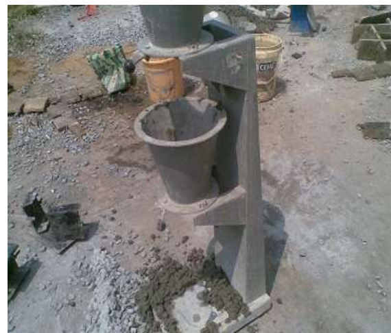
Figure 2. Compacting equipment

In this test, the top hopper (in the two hopper apparatus shown in figure 2) was filled with concrete to overflowing without compacting. The opening at the bottom was released successively allowing the concrete into the hopper below and consequently into the bottom cylinder. The weight of the concrete in the cylinder, W_1 was determined after leveling the surface (figure 3). The same cylinder was then filled with another sample of concrete from the batch, compacted and weighed to get the maximum weight, W_2 . The ratio of the observed weights W_1/W_2 gave the compacting factor.