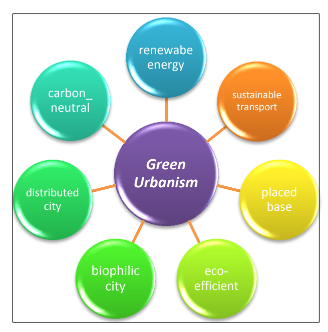
Figure 3 : Hypothetical model for the pursuit of green urbanism, Newman's view