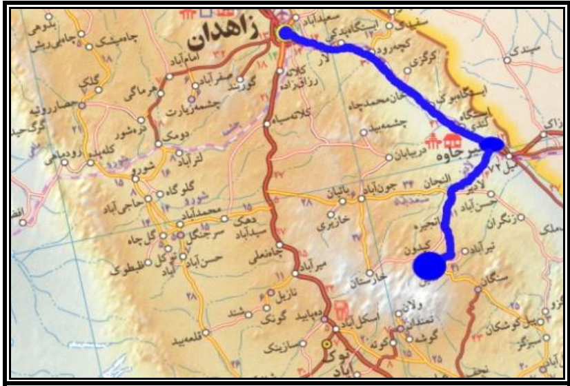
Figure 1: Location of Tamin Village, 2009