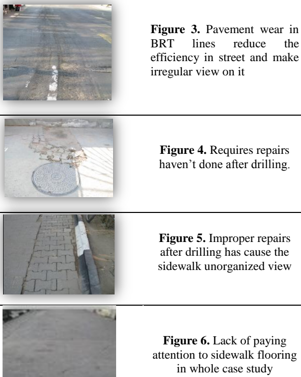
Table 2. Problems of flooring in the case study

BRT lines reduce the efficiency in street and make irregular view on it