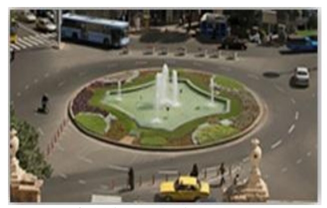
Figure 1. Fountain of Clock square

Space confinement: At this area, flooring is plain stone paving on the pavement and asphalt on the roadway. We should orientation that flooring is sub factors to increased or decreased of mental confinement and so that the individual building themselves are predominant and effective and have a good designing communication, just there's simple flooring is suitable for this space, and we can say that, the flooring is suitable for the space. In square, there is a fountain on the center of square due to increased focus and sense of confinement at this space. Due to placement fountain on the center of square, the confinement increased overall, totally the floor element creates suitable confinement at this space.