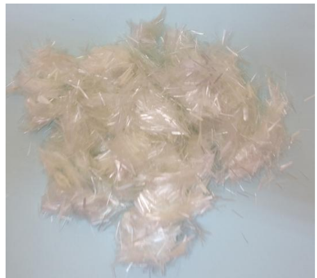
Figure 1. Polypropylene fibre