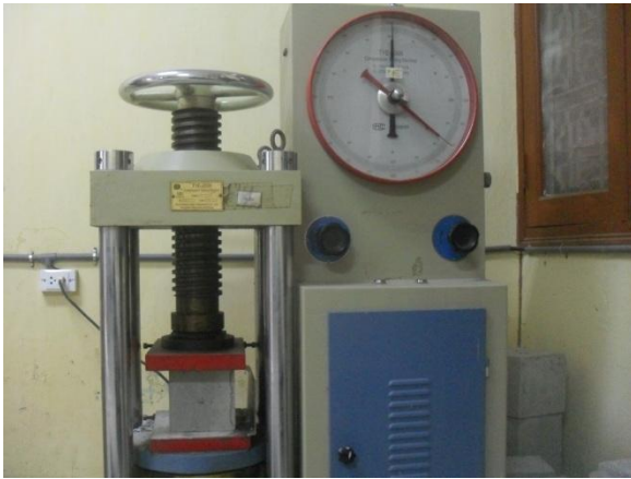
Figure 2. Hydraulic press machine for determining concrete strength