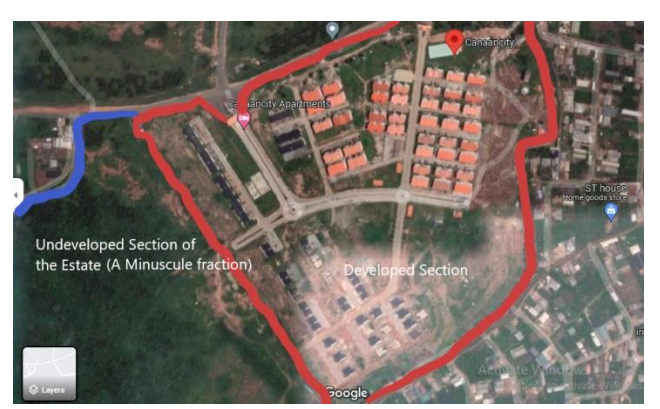
Figure 1. Aerial View of Canaan-city Estate, Iyana-Iyesi, Ota, Ogun state.

providing 15,000 housing units for both its staff and church members. It is located within the confines of Iyana-Iyesi directly behind Covenant University in Canaan land accessible via the Idiroko express way. It is constructed on approximately 8,000 hectares, acquired from villages in Iyesi, Ijaba, Osuke, Faru, Olukowonjo, Idimu, Okomi, Ibeju, Lemomu, Atan, Igbesa, Lusada, Ewutagbe, Imuta, Batera, Tatowu, Ikogbo, Imoshe, Igbo-Ota, Lafenwa and Olugbodo - all within Ota and its peripheral villages in Ogun state (Ecomium, 2016). Presently, the residential estate (Phase 1) comprises of various types of properties including, blocks of 1, 2 and 3-bedroom flats, blocks of 3bedroom luxury flats, semi-detached, detached and terraced housing types. It has a fence spanning about 400 km and it is expected to host the much anticipated Covenant University Teaching Hospital as well as a police station, fire service station, shopping malls, parks and gardens, sports centers, swimming pools and an independent power plant (IPP) among other facilities. Evidence from aerial views as provided by Google map shows that only about a minuscule of the 8,000 hectares (occupying Phase 1) apportioned for the construction of the estate has been developed.